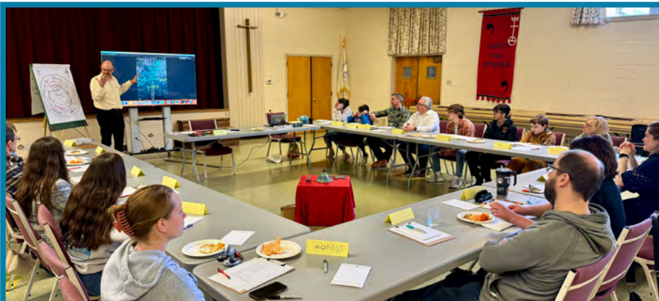
Confirmation Class Orientation meeting on April 7, 2024

Mother's Day Sunday - Join us for worship on May 12 at 10:30 a.m. as we honor and recognize those who mothered us.